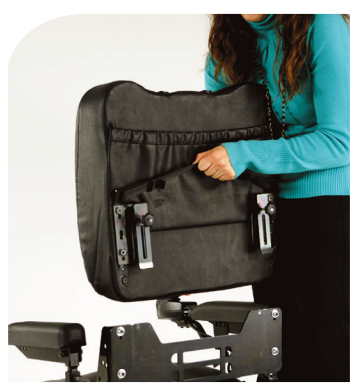
Back-Off easily removes back of mobility device to fit into shorter vehicle openings.