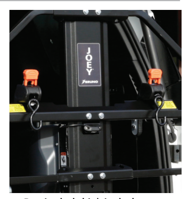
Barrier belt kit* includes two retractable securement straps for added peace of mind.