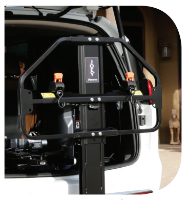
Industry-exclusive safety barrier. Protected by US Utility Patent No. 403.615