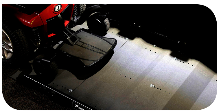
Platform illumination for night loading.