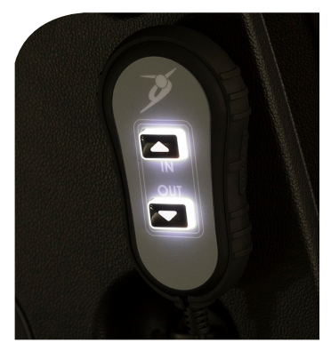
One button control with indicator light.