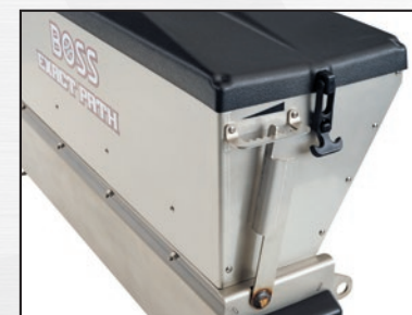
Adjustable Feed Gate Lever