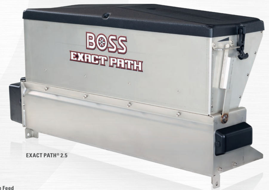
EXACT PATH® 2.5